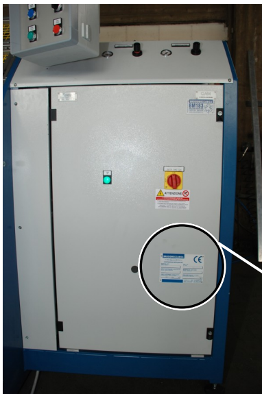
picture 1 - IDENTIFICATION PLATE

Always state the serial number of the machine when asking for technical assistance or ordering spare parts.