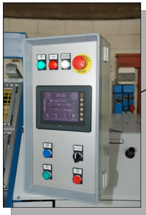
DRAWING 11 - control panel controls

The controls for the machine handling are located on the main control panel, located over the electric cabinet, and on the remote control panel, located on the machine's left side. In particular: